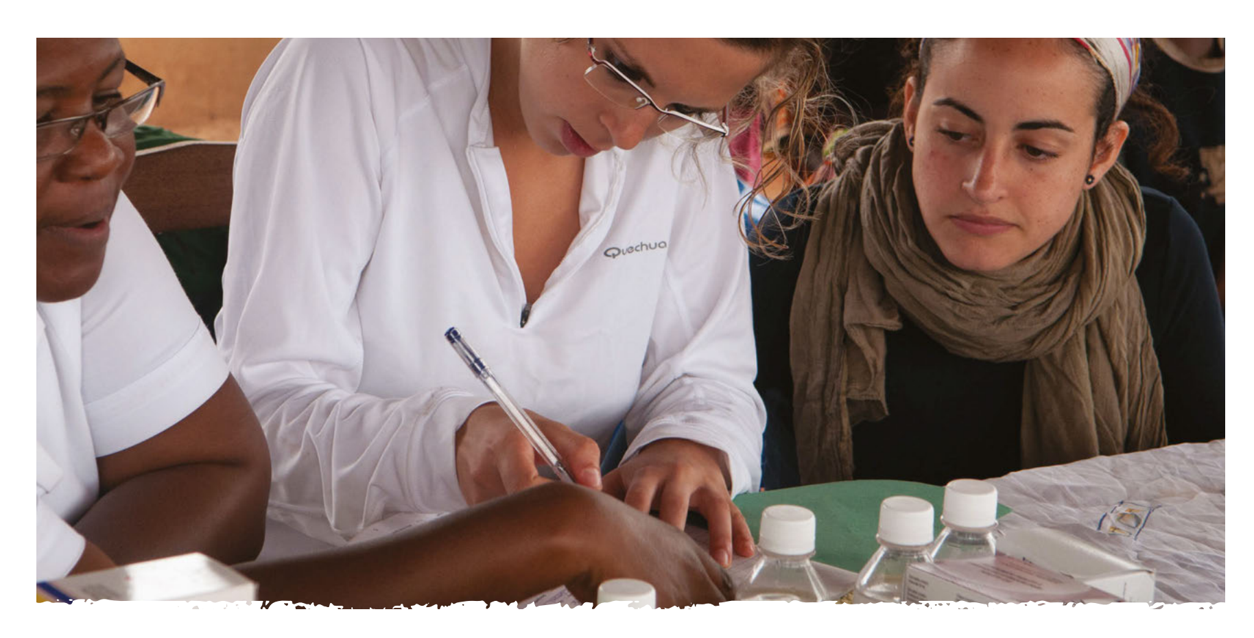
Medical Internship in Belize

Working with local staff in hospitals and clinics in areas such as nursing, specific hospital departments and health education, learning about local practices, structures and approaches.